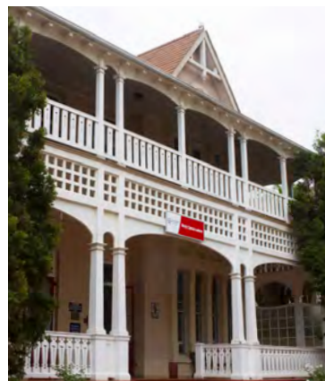
Bird Street Campus