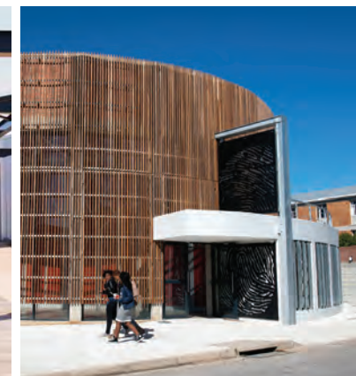
Second Avenue Campus

PO Box 77000 • Nelson Mandela Metropolitan University Port Elizabeth • 6031 • South Africa